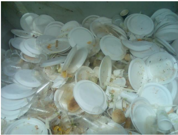
Compostable plates, cups, knives and forks in the BioBiN.