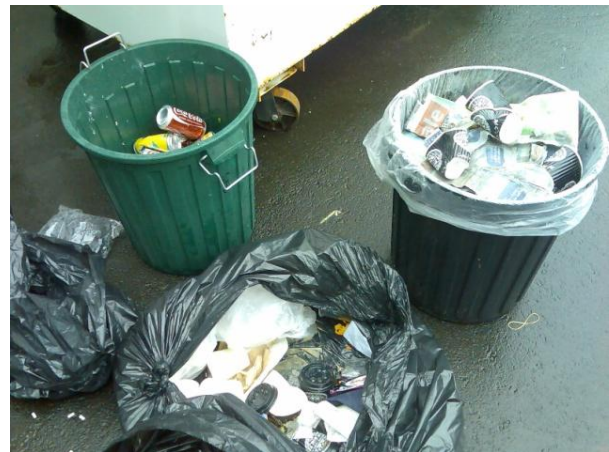
Materials sorted into recyclable waste and landfill waste.

On the final day of the conference both Green Connect and Resourcefull Recycling staff recovered resources from the landfill bin in loading dock area, back of stage. This was an area that was not provided with the 4 waste stream collection bins and received no monitoring. It is also where the SEC cleaners deposited their waste.