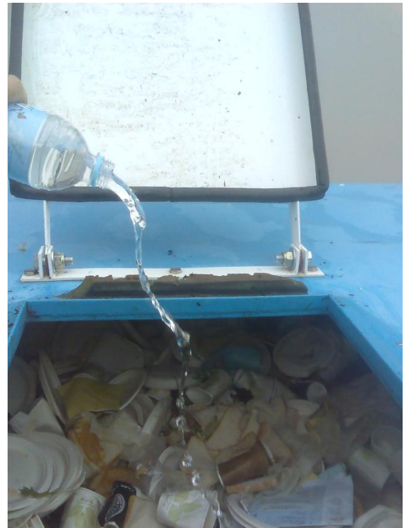
Pictured above – Water from drink bottles was recycled through the BioBiN.