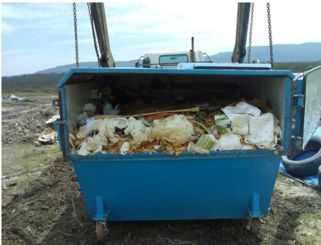
Pictured left – BioBiN with LGSA contents arriving to be composted with shredded green waste.