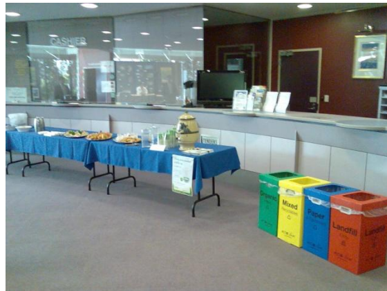
A 60litre waste station using the Eco-bins. These are distinctly colour coded and clearly labelled. These were monitored by Green Connect.